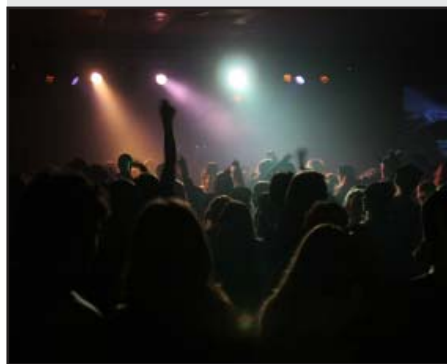
Top: Anime Detour Opening Ceremonies at Anime Detour 2007 Bottom: Saturday Night Dance at Anime Detour 2007